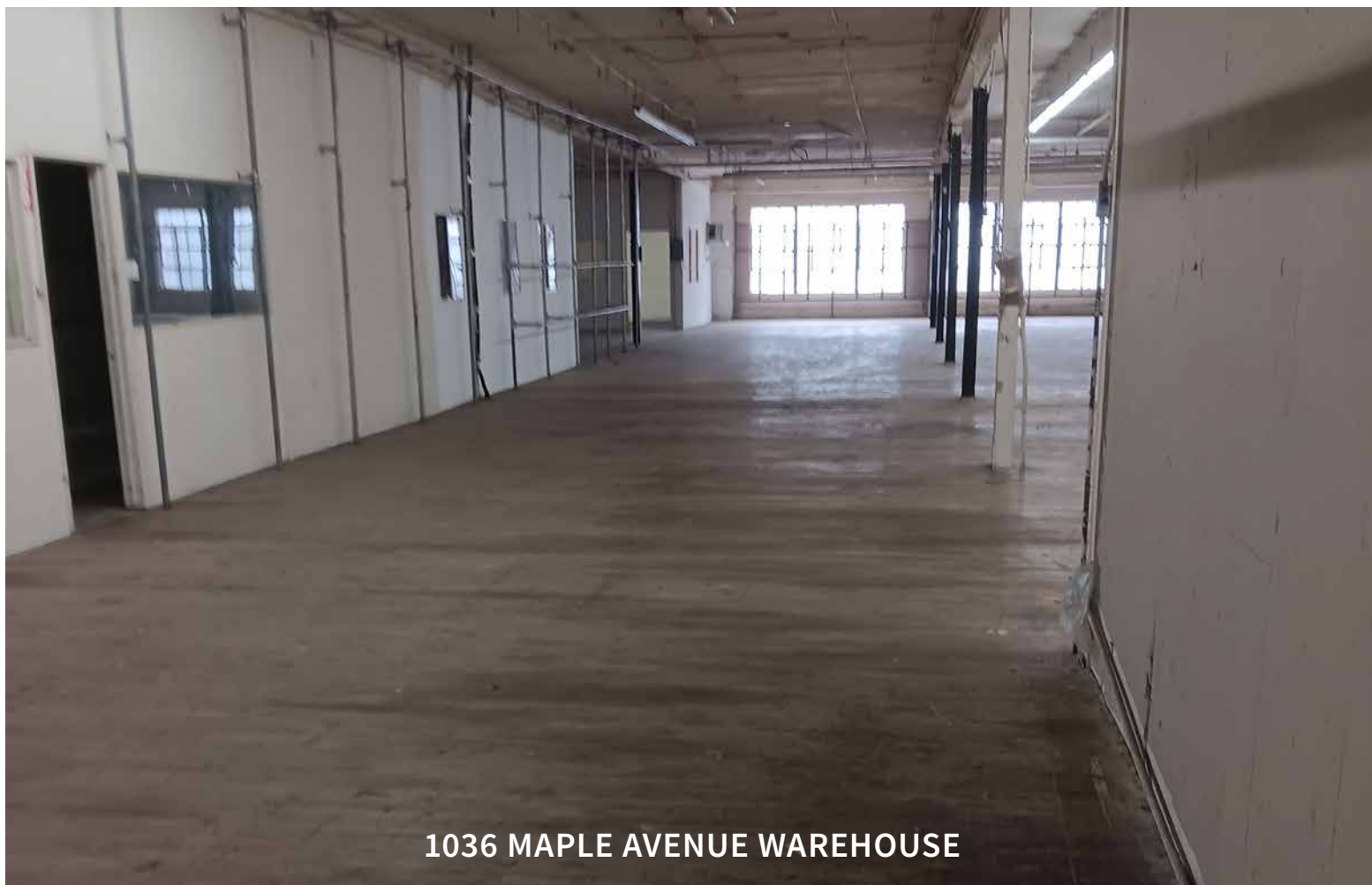
1036 MAPLE AVENUE WAREHOUSE