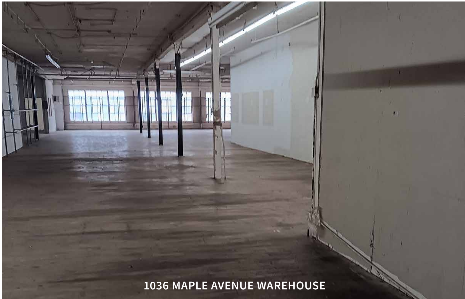
1036 MAPLE AVENUE WAREHOUSE