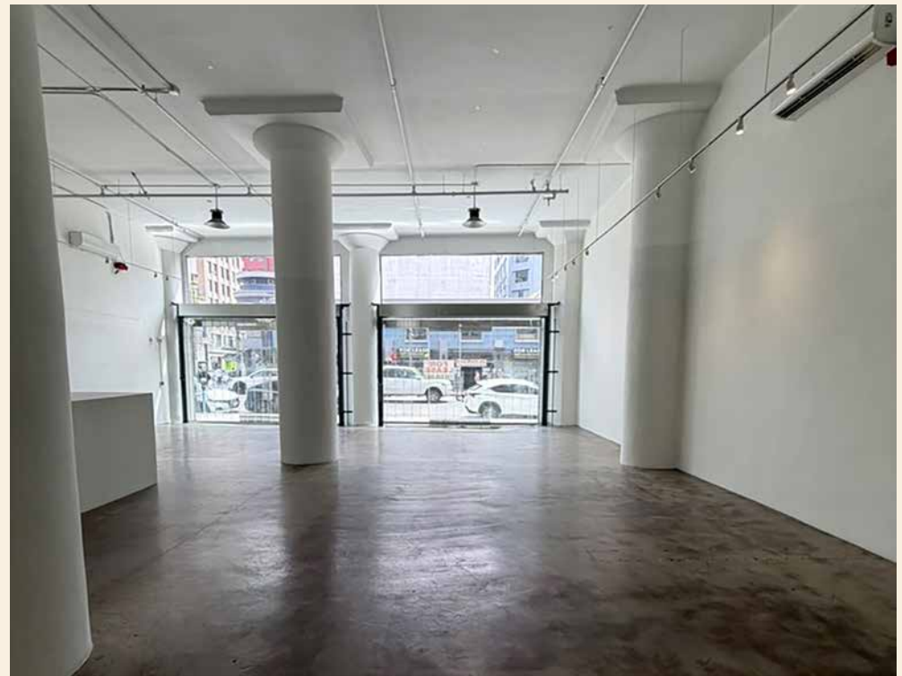
GROUND FLOOR RETAIL